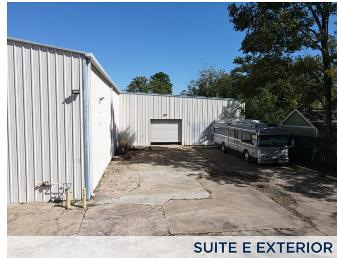
SUITE E EXTERIOR