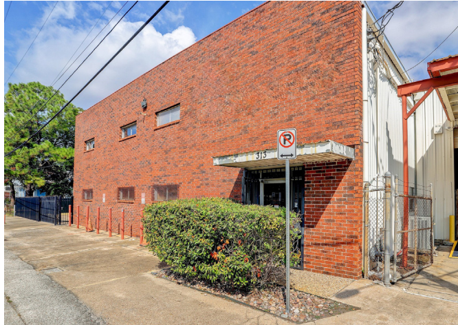
SUITE B EXTERIOR