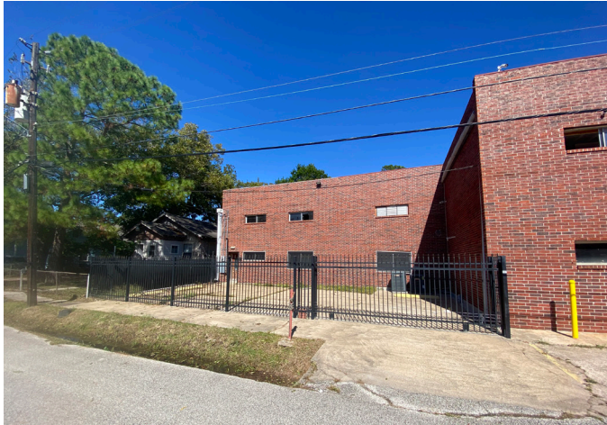
SUITE A EXTERIOR