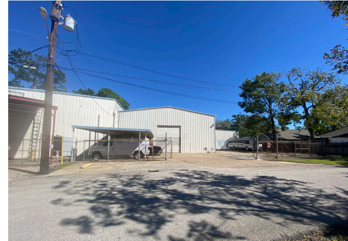
SUITE D EXTERIOR