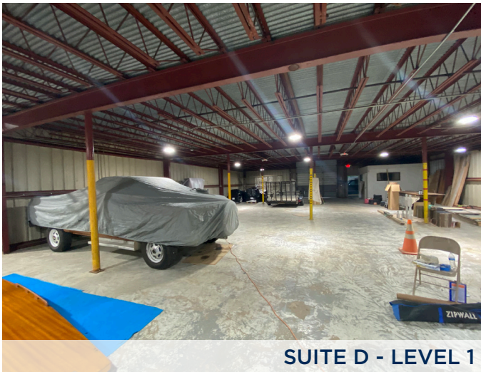
SUITE D - LEVEL 1