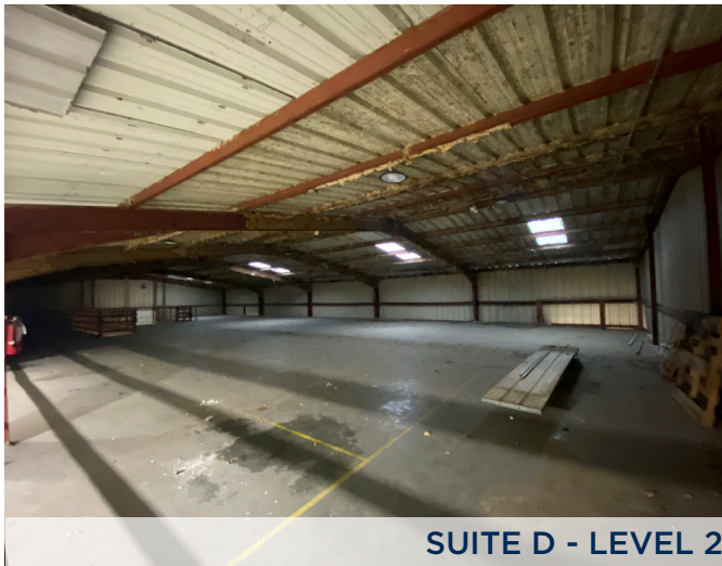
SUITE D - LEVEL 2